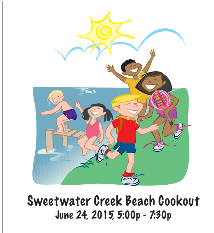
Sweetwater Creek Beach Cookout June 24, 2015, 5:00p - 7:30p

Nestled in the foothills of the North Georgia mountains on 400 acres, Glisson Camp and Retreat Center in Dahlonega, Georgia has provided children, youth and adults 90 years of outdoor living, playing and worship experiences. The children from every NGUMC congregation are invited to join in the fun of a weekend full of faith forming experiences created specifically for them.